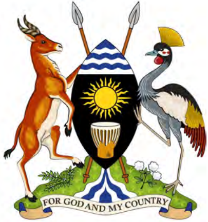
Ugandan Ministry of Health